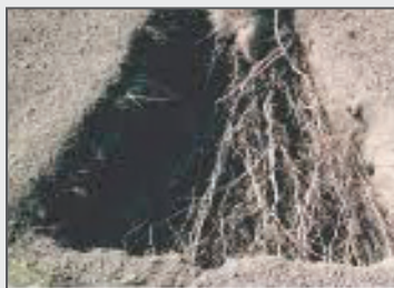
3 YEARS AFTER TREATMENT